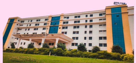
BRIMS COLLEGE CAMPUS